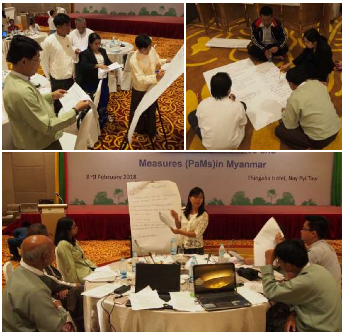
Photos: Participants discuss potential benefits and risks of proposed REDD+ PaMs